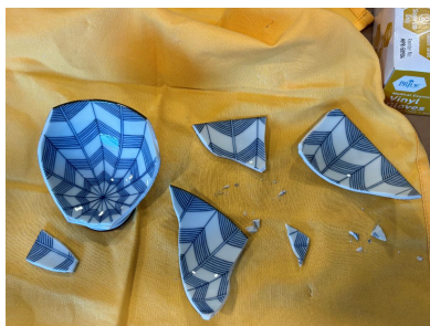
God takes our broken pieces

We are continuing to pray about the next location for Springwater. The clocktower at Life Community Church in Quincy has been good to us, and I welcome you to come visit any time! I'd love to catch up and pray together.