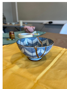
Puts them together and makes them beautiful